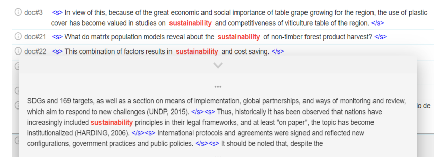
Figure 3. Expanded concordance lines with the search word "sustainability" in BrACE

By having a longer text, we can see the author was discussing the biogeographical model of "islands of diversity" which are protected natural spaces related to environmental policy strategies. By searching for keywords from the SDGs we can know how Brazilian researchers were dealing with the theme and how they used the academic language, which is also the focus of this analysis.