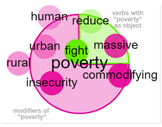
Figure 4. WordSketch of "poverty" in BrACE.

As we did with "sustainability", we wanted to see the search word "poverty" in different positions in the word cloud image, as it is shown in Fig. 4